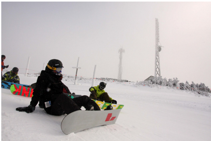
We opened the Timberline Quad 1/6, giving us top-to-bottom skiing and riding.